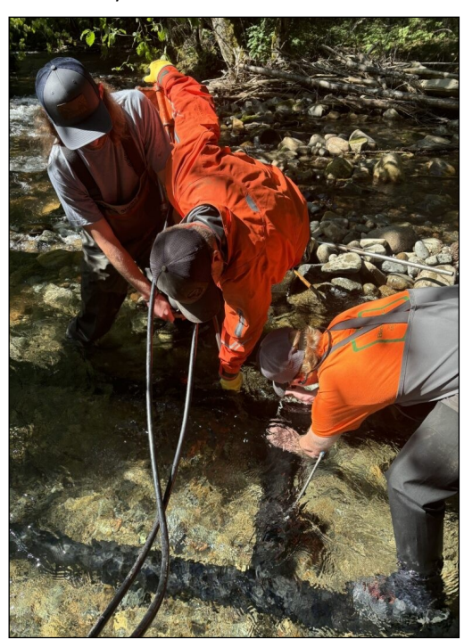
Biologists install a PIT array system in Grouse Creek

Idaho Fish and Game and Avista biologists, with funding from the Clark Fork Settlement Agreement, recently installed a new fish monitoring system in both the Pack River and Grouse Creek called a Passive Integrated Transponder (PIT) tag detection system.