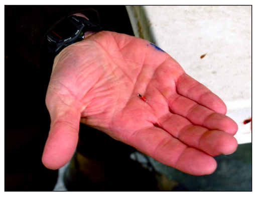
Pit tag average size

PIT tag data help biologists to estimate the distribution, abundance, and movement of Bull Trout and Westslope Cutthroat Trout. Biologists also use PIT tag data to identify migration timing, duration of spawning activities, and instream survival of fish in the Pack River and other Lake Pend Oreille tributaries.