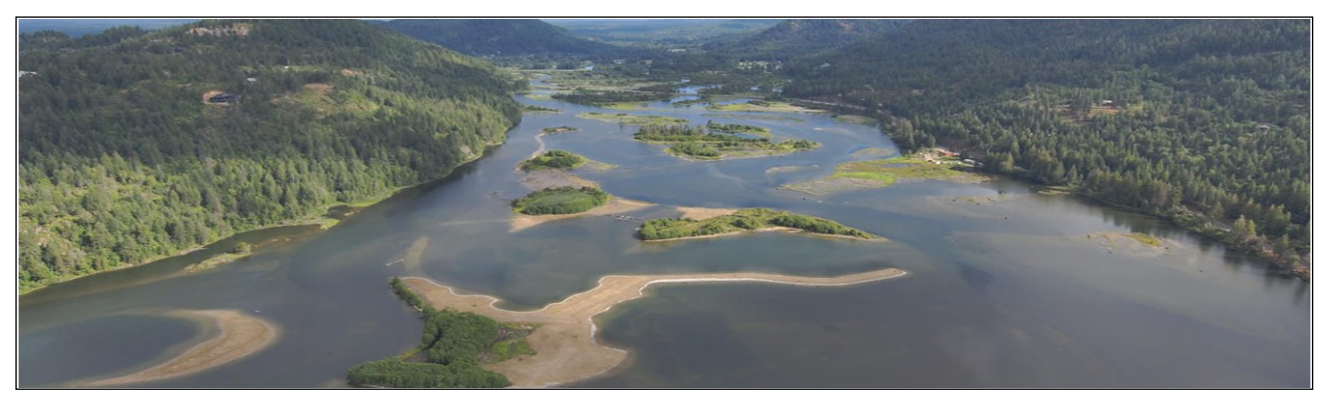
Pack River Delta Restoration Project (IDFG 2024)

Idaho Department of Fish and Game (IDFG) has completed the second phase of the Pack River Delta Restoration project. The project started in October 2023 and was completed in June 2024.